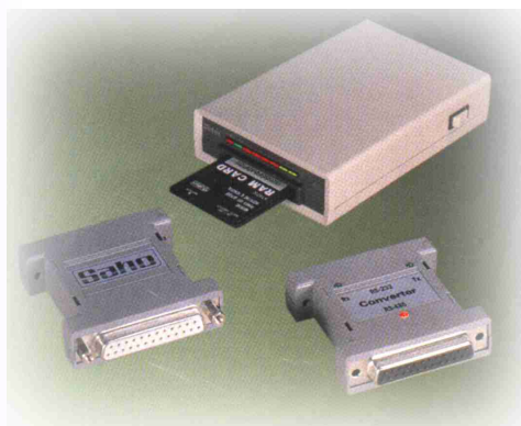
SK-404 RAM Card Reader & Converters